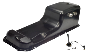
264-5517 Mack 2015-07, Volvo 2017-05 (38qt. Capacity) OE Number: 21377346