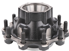
11-R656A-73L (Left Side) OE Number: 20231-MLT

NEW COVERAGE | ENGINEERED TO MATCH THE FIT AND FUNCTION OF THE OE TRAILER HUBS | MADE IN THE USA