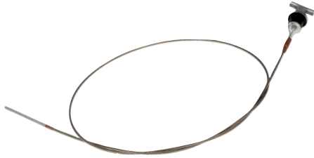
917-6005 Mack 2010, Mack 2008-04 (Press On; 66 In. Length) OE Number: 25195290

COST-EFFECTIVE RELIABLE DIRECT REPLACEMENTS