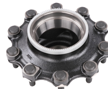
11-R656A-73R (Right Side) OE Number: 20231-MRT

Accepts outer bearing set SET413 (not included). Accepts inner bearing set SET414 (not included). ABS on hub. Drum mounting: 8.78" pilot, 11.25" bolt circle. 10 stud standard outboard mount drum for hub pilot wheel mounting system, Fits tapered or parallel spindle for steel or aluminum wheels.