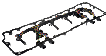
264-5123 IC Corporation 2015-12, International 2015-12 (Engine Desg. MaxxForce DT; Engine Mfr International, without Jake Brake) OE Number: 1882222C93